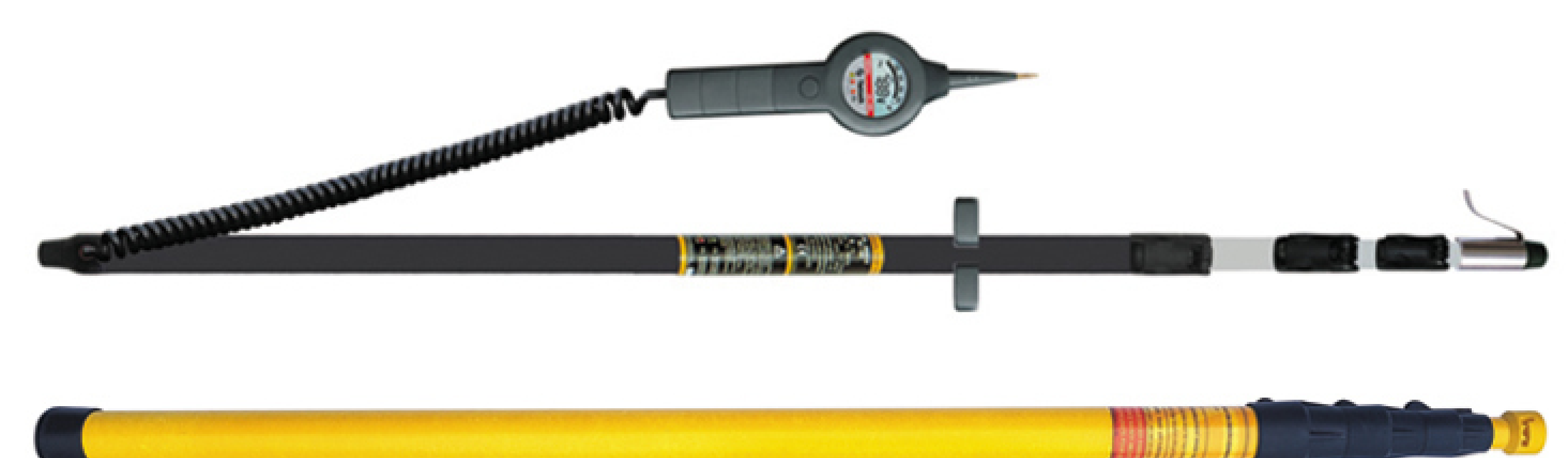
Spannungsprüfer und Erdungsequipment