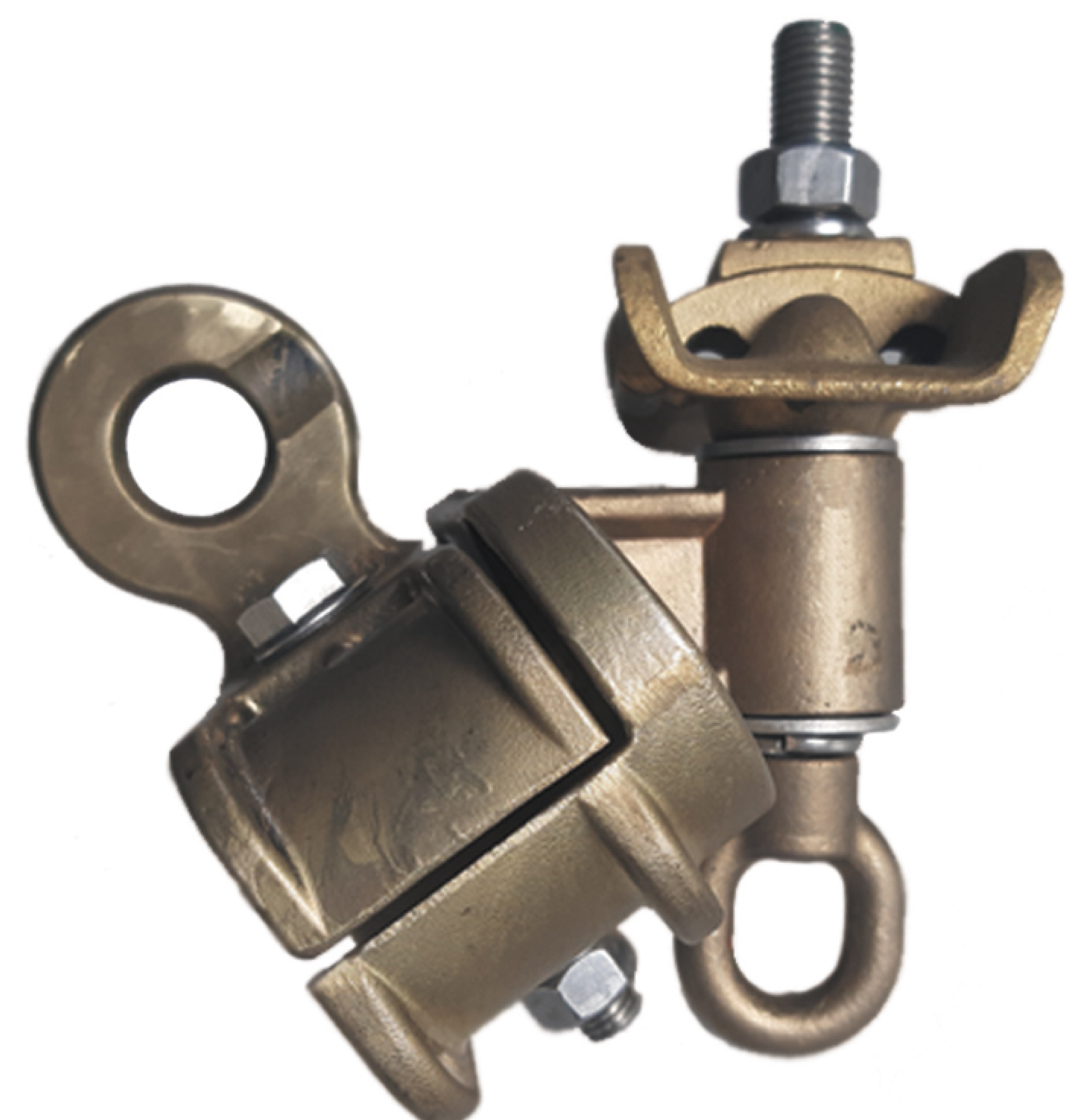
Auslegerkopf für 2 Rohre

Following our principles only high quality, long-lasting raw materials and primary materials get in the value-added chain.