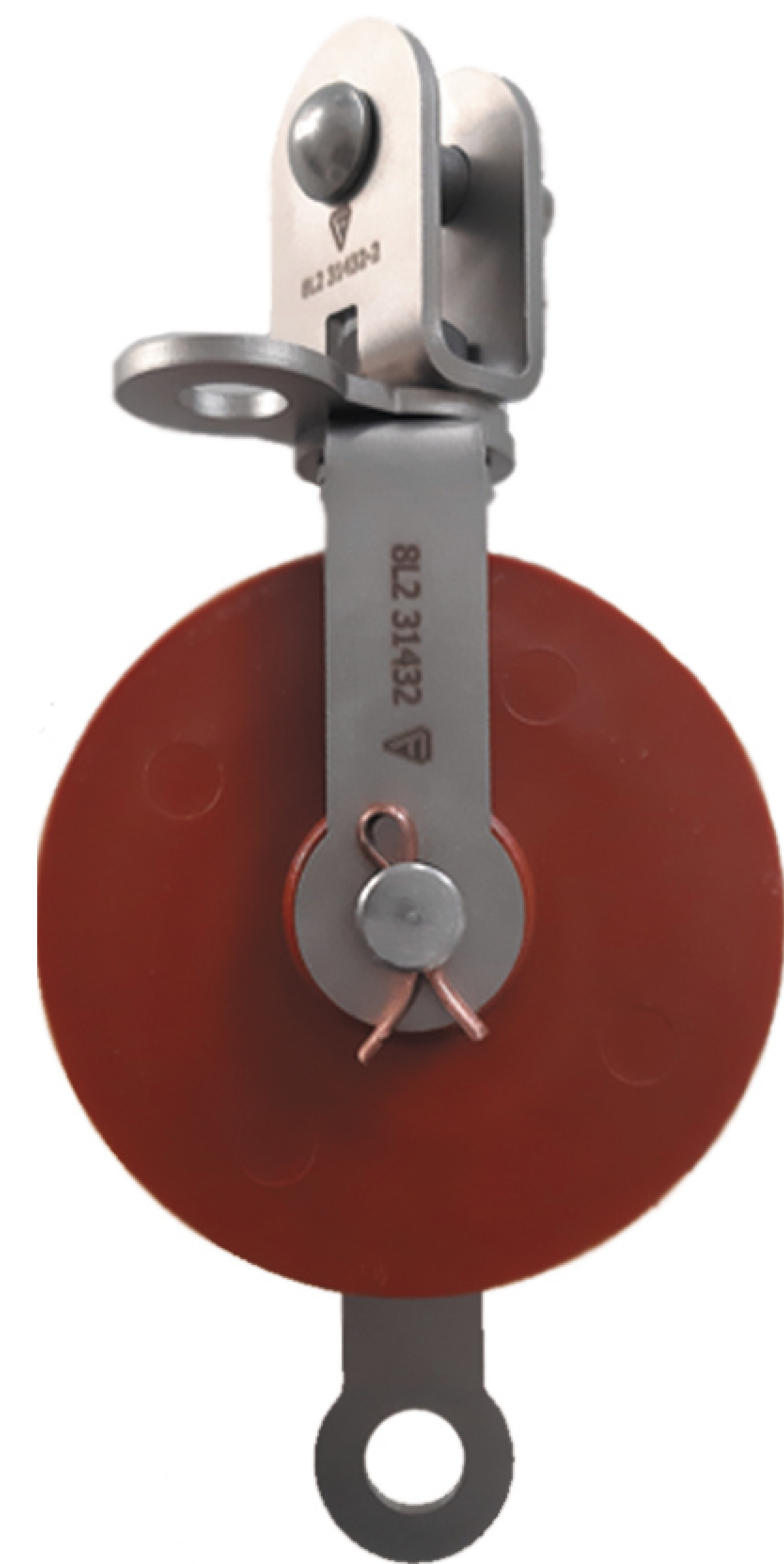
Tragseilrolle mit zusätzlicher Haltetasche