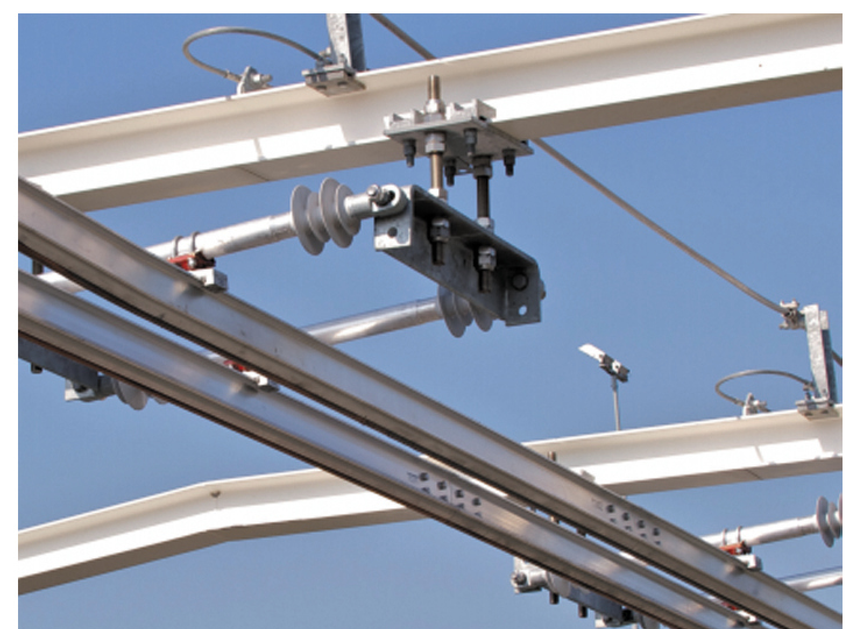
Deckenstromschiene, Al-profil mit eingezogenem FD

We have voltagetesters, earthing-equipment and all tools for the installation and maintenance in our portfolio. Easy to use, new and inspired by the requirements of the User at site.